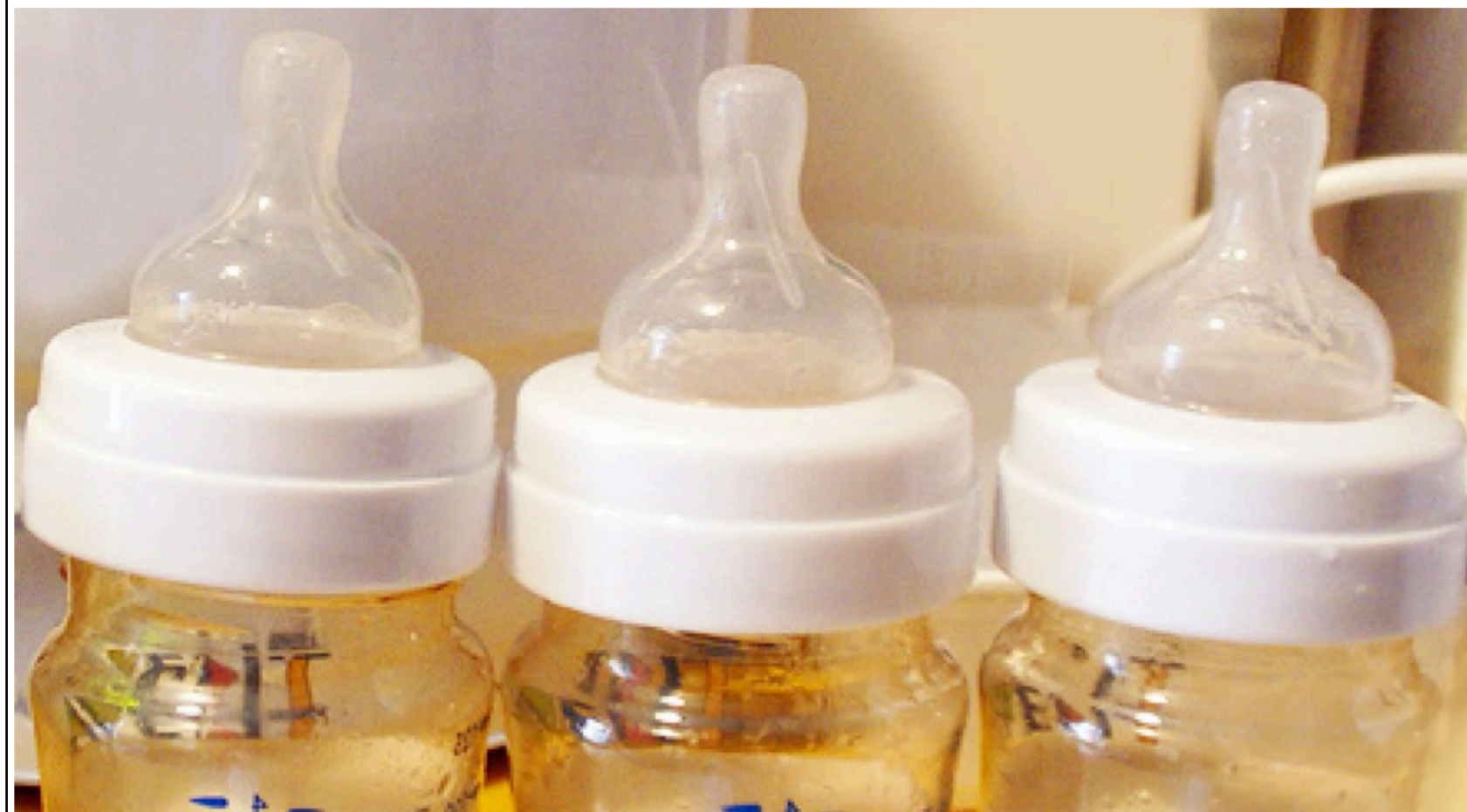
Baby formula (Picture: Wikimedia Commons/Симилак) - Credit: Baby formula (Picture: Wikimedia Commons/Симилак)

BUSINESS FOOD BABY FORMULA ALBERT HEIJN NUTRILON NUTRICIA » MORE TAGS SHARE THIS: [social media icons]